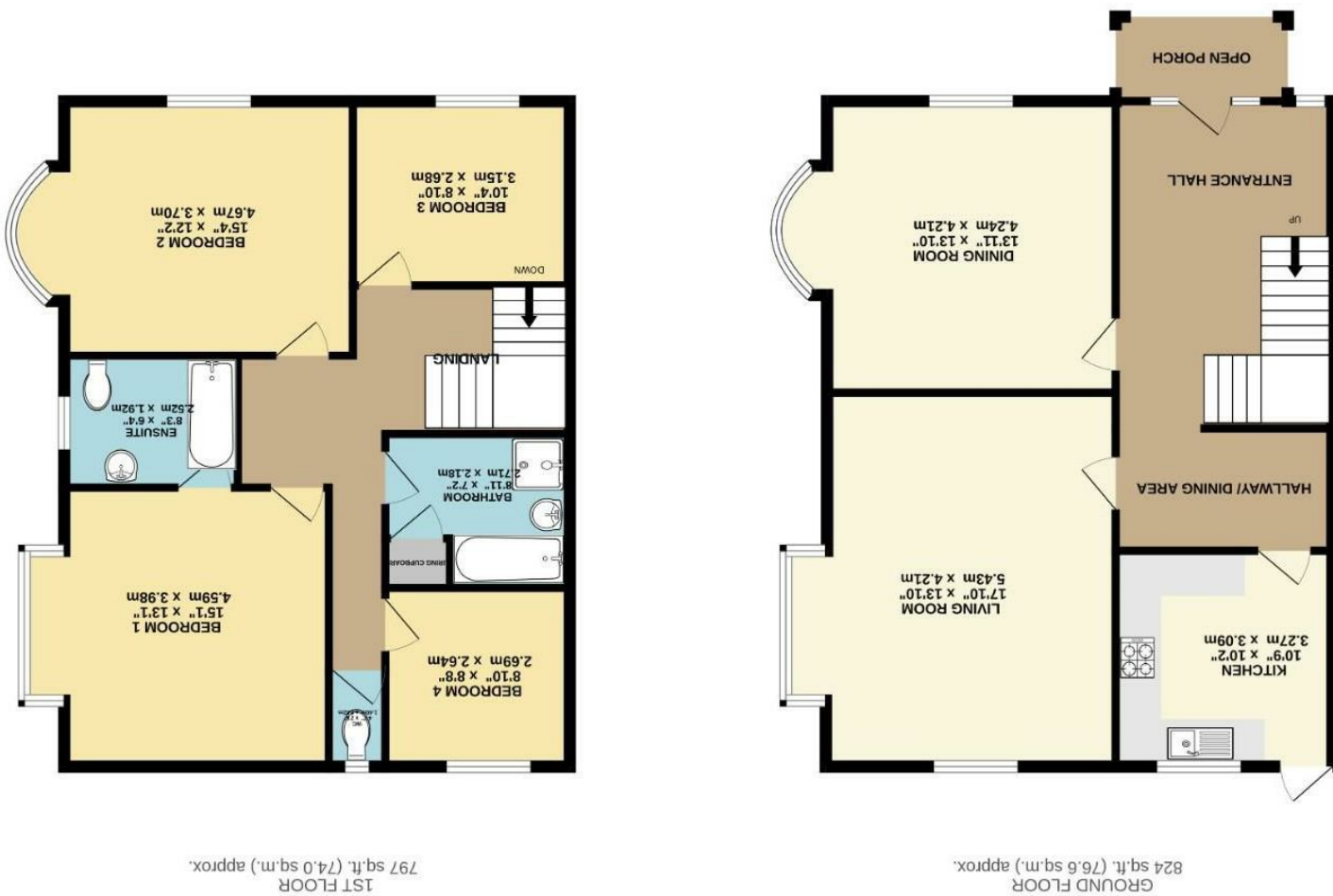
GROUND FLOOR 824 sq.ft. (76.6 sq.m.) approx.

TOTAL FLOOR AREA: 1621 sq.ft. (150.6 sq.m.) approx. Measurements are approximate. Not to scale. Illustrative purposes only. Made with Hexpix ©2024